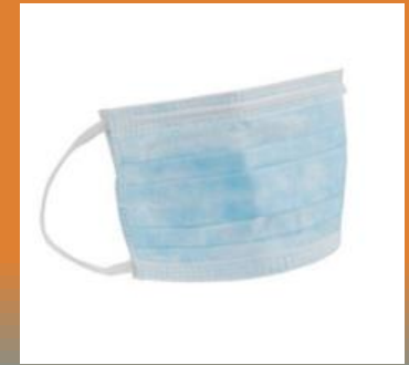
Mask, 1820, Earloop, Procedure Face, 3M 651500L033173