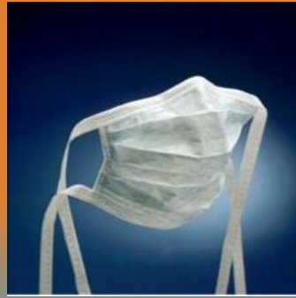
Mask, Surgical, Tie On, 1818, 3M 846500N203181