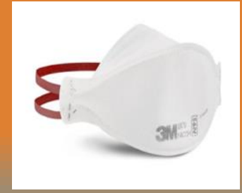
Mask, 1870+ (N95) Respirator, Flat Fold, 3M 651500N156815 (Replaces 1860 and 1860S)