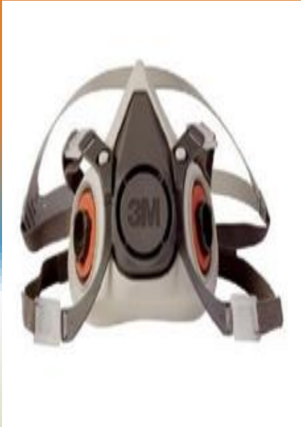
Mask, Reusable Respirator, Half Facepiece, Small, 6100, 3M 846500N206100