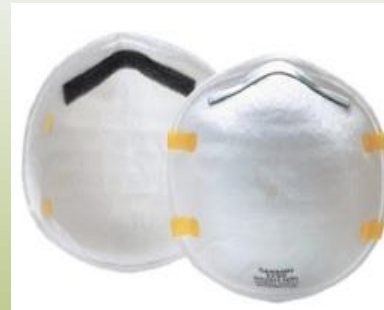
Mask, N95, Respirator, 1730, Gerson 846500N203730