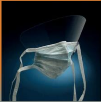
Mask, Surgical, Tie On with Faceshield, 1818FS, 3M 846500N204918