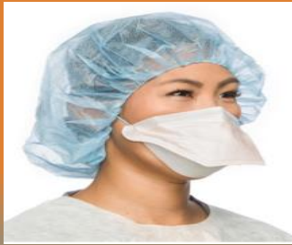
Mask, N95 Fluid Faceshield, Particulate Filter Respirator, 46727 3M/Halyard 846500N204672