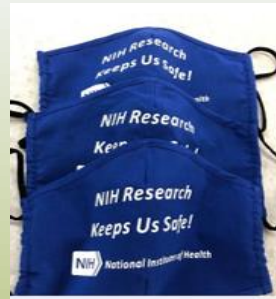
Mask, Cloth, Earloop, 3- Ply, w/NIH Logo, Halyard 846500N203731 This is a cloth mask and cannot be used in lab or animal areas.