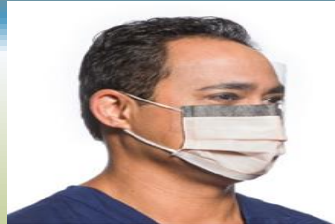
Mask, Fluidshield, w/ Soft Lining, Visor, 47137, Halyard 846500N204713 Mask does not qualify for close proximity work that requires a mask AND face shield, as described in the NIH PPE matrix appendix to the NIH Guideline for return to the workplace.

NOTE: Mask Levels are based on ASTM Standards