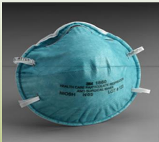
Mask, 1860S (N95), Respirator, 3M 651500L036867