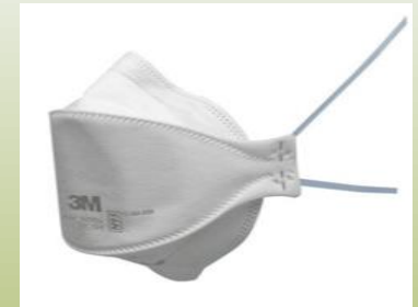
Mask, 9205+, N95 Particulate Respirator, 3M 846500N209205 (Replaces 9211, 9210, and 8210)

NOTE: Mask Levels are based on ASTM Standards