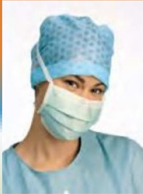
Mask, Surgical, Tie Closure Barrier, MonInlycke 846500N208154