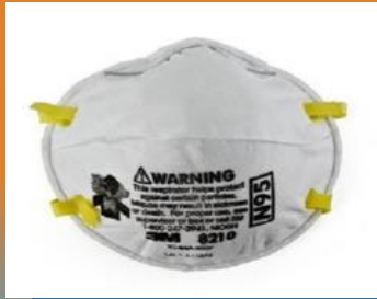
Mask, N95 Respirator, 8210, 3M 846500N208210