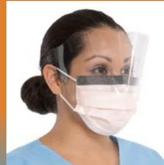
Mask, 1820FS, Earloop w/FaceShield, 3M 6515013419703