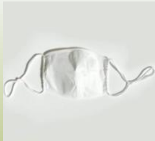
Mask, Cloth, Earloop, 3- Ply, White Halyard 846500N203734 This is a cloth mask and cannot be used in lab or animal areas.