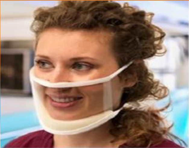
Mask, ClearMask, ClearMask 846500N203732 The ClearMask is a face mask, not a respirator mask