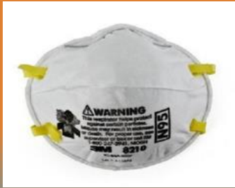
Mask, N95 Respirator, 8210 846500N208210