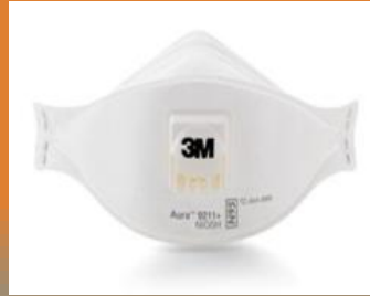
Mask, N95 Respirator, 9211+ 846500N209211