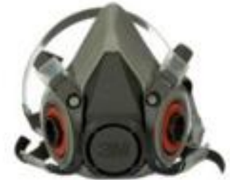
Mask, Reusable Respirator, Half Facepiece, Small, 6100 846500N206100