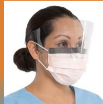
Mask, 1820FS, Earloop w/FaceShield 6515013419703