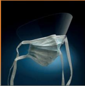
Mask, Surgical, Tie On with Faceshield, 1818FS 846500N204918