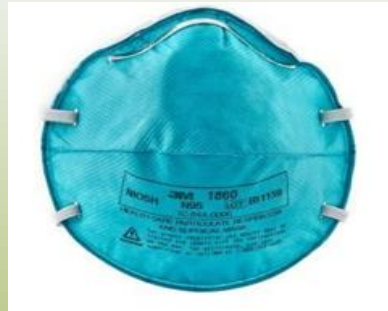
Mask, 1860S (N95), Respirator, Small 651500N156814