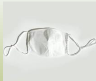
Mask, Cloth, Earloop, 3-Ply, White 846500N203734 This is a cloth mask and cannot be used in lab or animal areas.