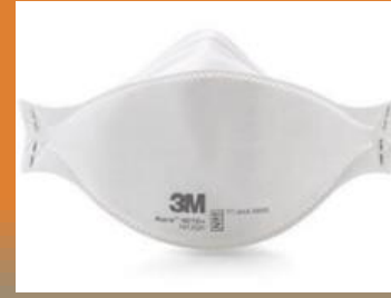
Mask, N95 Respirator, 9210+ 846500N209210