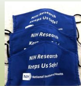
Mask, Cloth, Earloop, 3-Ply, w/NIH Logo 846500N203731 This is a cloth mask and cannot be used in lab or animal areas.