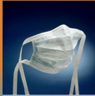
Mask, Surgical, Tie On, 1818 846500N203181