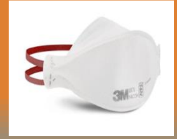
Mask, 1870+ (N95) Respirator, Flat Fold 651500N156815