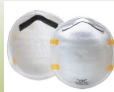
Mask, N95, Respirator, 1730 846500N203730