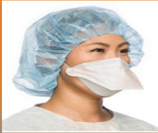
Mask, N95 Fluid Faceshield, Particulate Filter Respirator, 46727 846500N204672