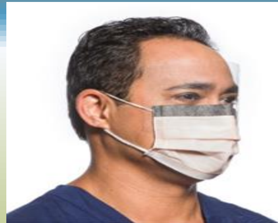
Mask, Fluidshield, w/ Soft Lining, Visor, 47137 846500N204713

The ClearMask is a face mask, not a respirator mask