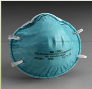
Mask, 1860S (N95), Respirator 651500L036867