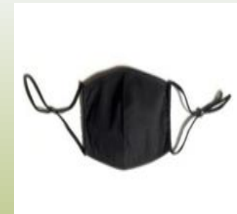
Mask, Cloth, Earloop, 3-Ply, Black 846500N203735 This is a cloth mask and cannot be used in lab or animal areas.

NOTE: Mask Levels are based on ASTM Standards