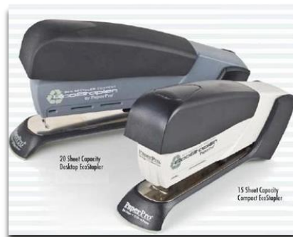
STAPLER, DESK-TOP, ECO NSN: 752000L055727 Unit of Issue: Each $15.85