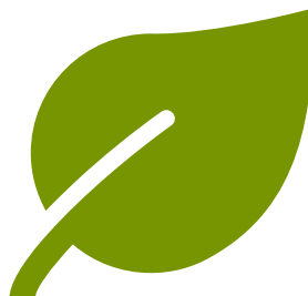
PAPER PLATES, BIODEGRADEABLE, 9" NSN: 735000L040679 Unit of Issue: Package (125/package) $14.20