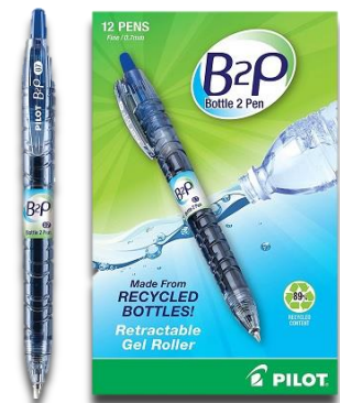
PEN, ROLLER, GEL, RETRACTABLE, BLUE NSN: 752000N217137 Unit of Issue: Package (12/pack) $14.04