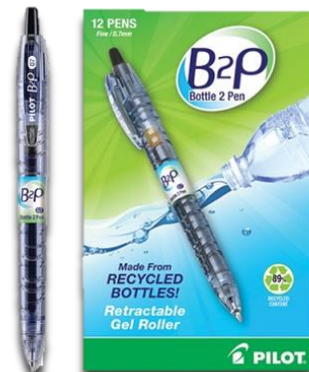
PEN, ROLLER, GEL, RETRACTABLE, BLACK NSN: 752000N217136 Unit of Issue: Package (12/pack) $14.04