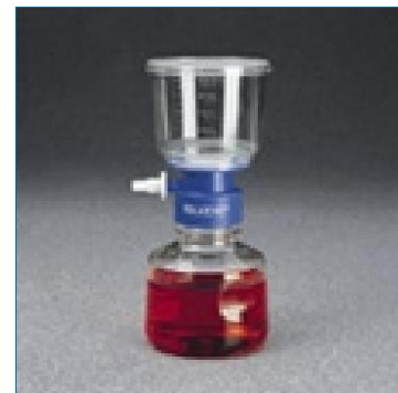
Filter Unit, 250mL, 3M NSN: 664000L012114 Price: $61.51/Case