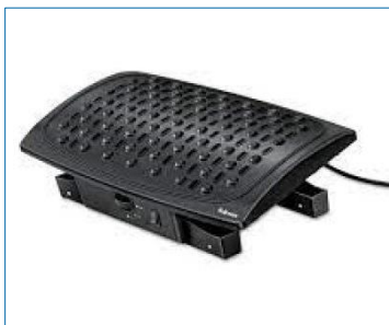
FOOTREST, CLIMATE CONTROL NSN: 711000N230901 Price: $64.01/Each