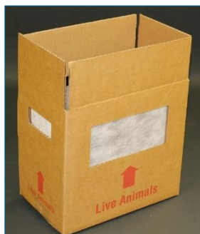
BOX, SHIPPING, ANIMAL, W/FILTERS, 10X6X9" NSN: 811500L040816 Price: $145.00/Bundle