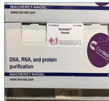
NucleoSpin® Plasmid Kit NSN: 650500L060346 Price: $277.10/Kit