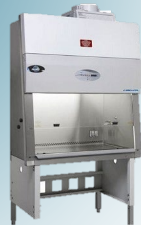
BIOSAFETY CABINET, TYPE A2, NUAIRE CLASS II

*On the full product list below, please note that any items containing MBS will include a motorized base stand