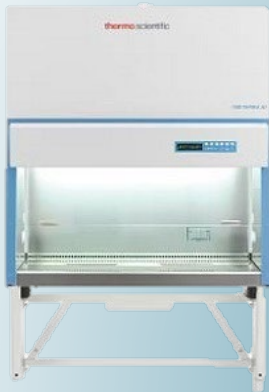
BIOSAFETY CABINET, 1300 A2 CLASS II