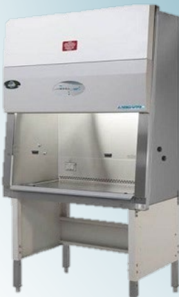
BIOSAFETY CABINET, TYPE A2, NUAIRE CLASS II