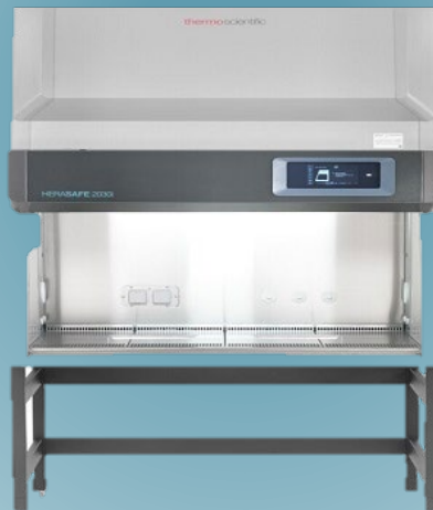
BIOSAFETY CABINET, HERASAFE 2030I